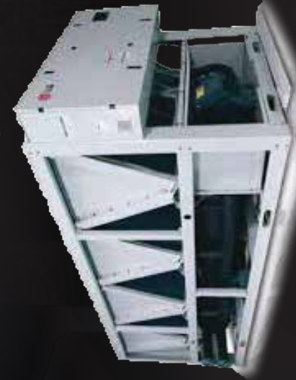
Air Cooled Screw Chiller 80~500 RT