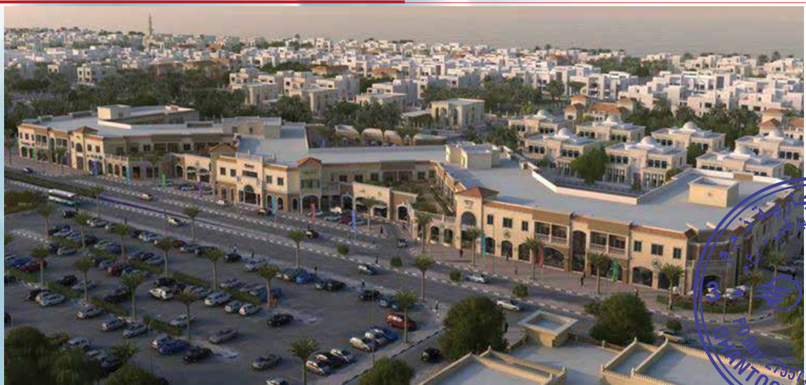
1,616TR Multi V III (160 units) ; High Static Duct (394 units)