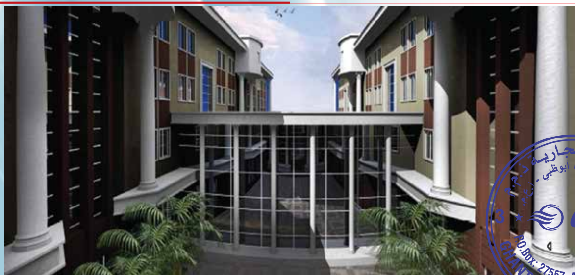
1,100TR Multi V IV ; Cassette, High Static Duct (412 units) & FAHU