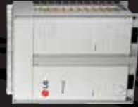
Scroll Chiller (Water cooled) 40-160 RT