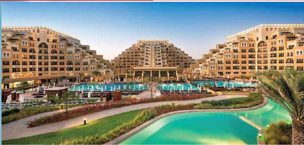
735TR Multi V III (72 units) ; High Static Duct, FAHU (341 units)