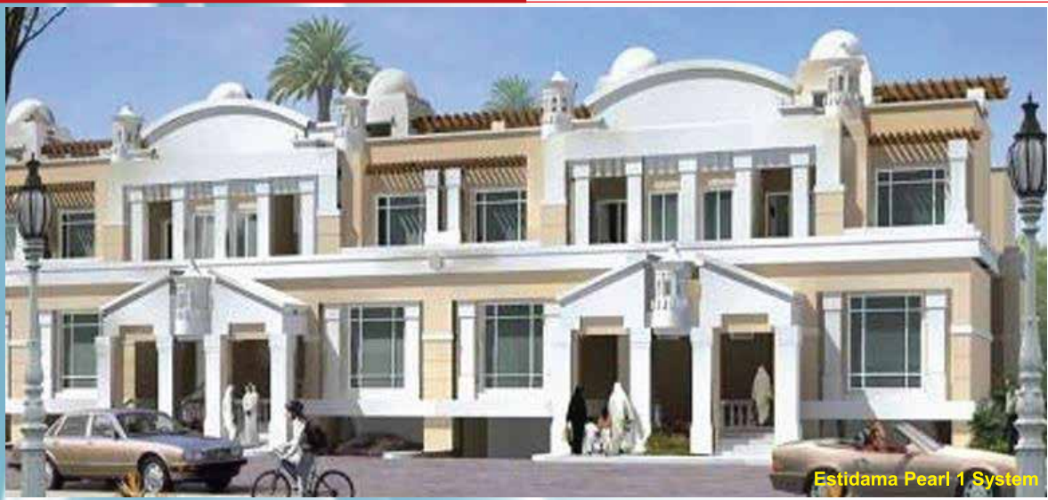
5,361TR Multi V II (827 units) ; High Static Duct (4,000 units)