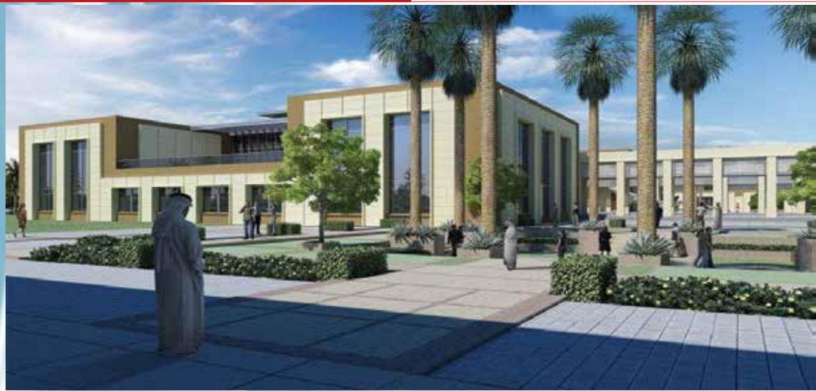
1,700TR Multi V III ; High Static Duct, FAHU (55 units)