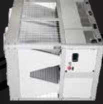
Scroll Chiller (Air cooled) 20-180 RT