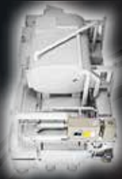
Absorption Chiller 80-500 RT