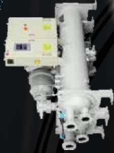
Screw Chiller (Water cooled) 80-380 RT

1 Stage: 250-2,000 (option 2,000-4,000RT) 2 Stages: 200-3,000RT