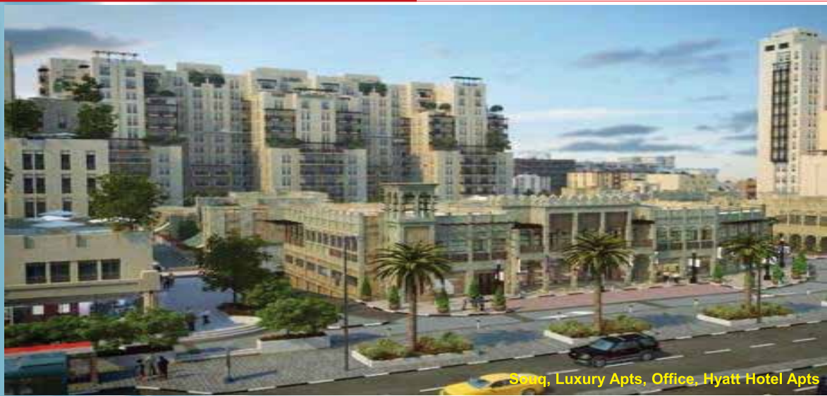
Seaq, Luxury Apts, Office, Hyatt Hotel Apts

2,625TR Multi V IV Tropical (580 units) ; High Static Duct (2,030 units)