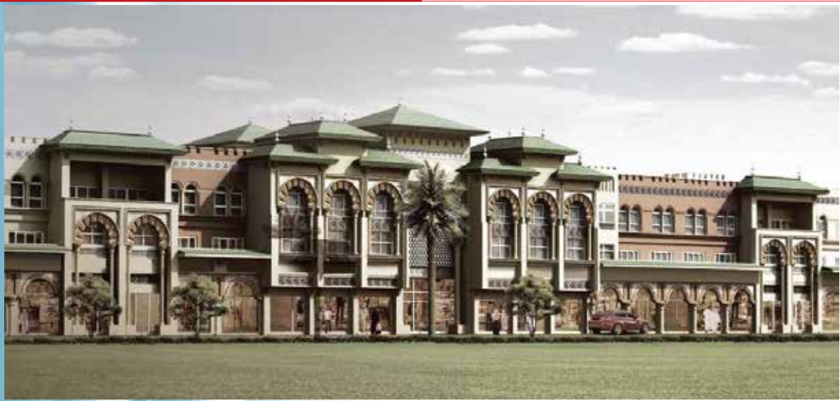
2,766TR Multi V III (304 units) ; High Static Duct (1,485 units)